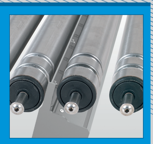
Drying / cleaning from the bottom on a roller conveyor

parts, components and surfaces must be freed from liquids in the plastic or metal machining, the Ziegener + Frick air knives are able to perform effectively and economically to the highest degree.