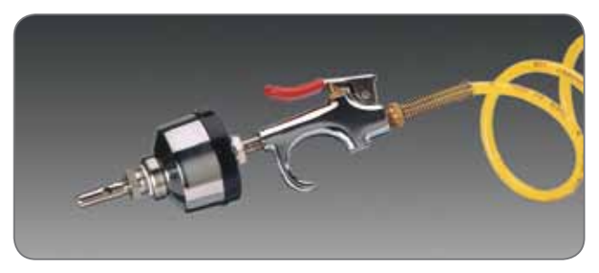
Optional gun/hose kit (p/n 91-6150).